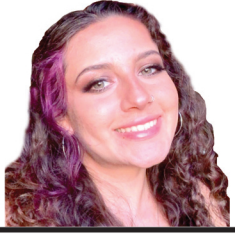
Madison Fagundes STAFF WRITER

Many big food corporations sell their products all over the world and their ingredients vary from country to country depending on different regulations.