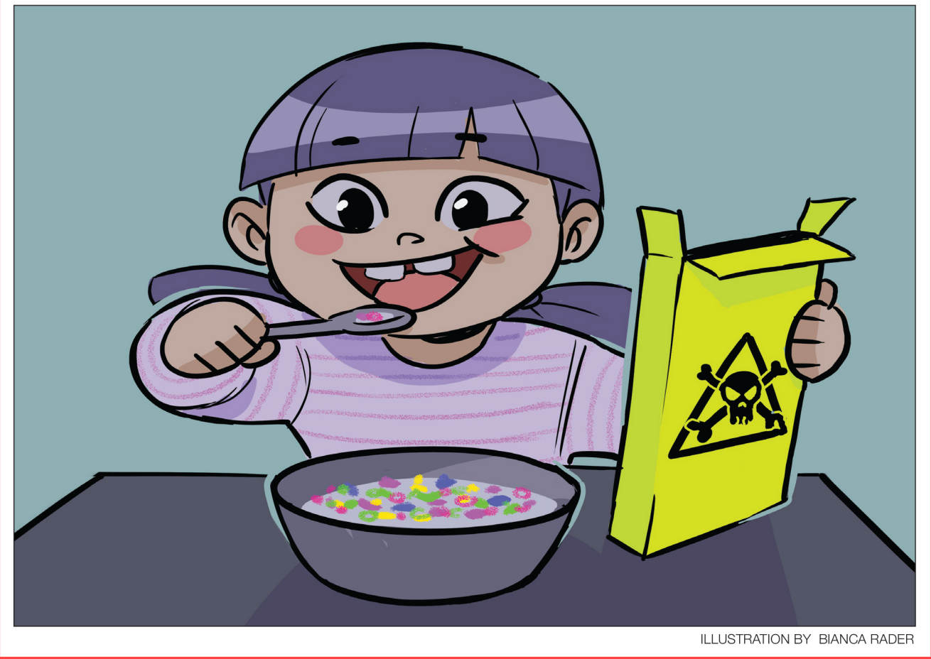
ILLUSTRATION BY BIANCA RADER

Though an effective leavening agent, potassium bromate is also known to cause cancer in rats and is thought to be carcinogenic to humans, according to a